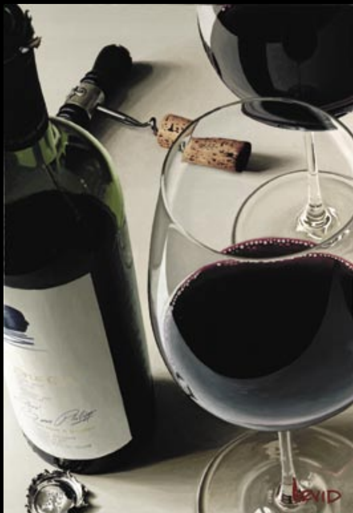
Elements , limited edition giclee, 29" x 20"